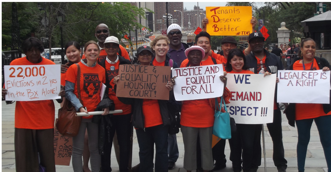
Initial rally to introduce Right to Counsel legislation in 2014

In 2017, New York City became the first city in the country to establish a Right to Counsel for tenants facing eviction. This was the outcome of years of dedicated tenant organizing begun by the tenants' rights organizing group Community Action for Safe Apartments (CASA) and continued by the citywide Right to Counsel NYC Coalition (RTCNYC), which CASA helped form. Right to Counsel in New York represented a landmark organizing victory for the coalition and a monumental win in the fight for tenants' rights and equity in housing and has inspired a national movement.