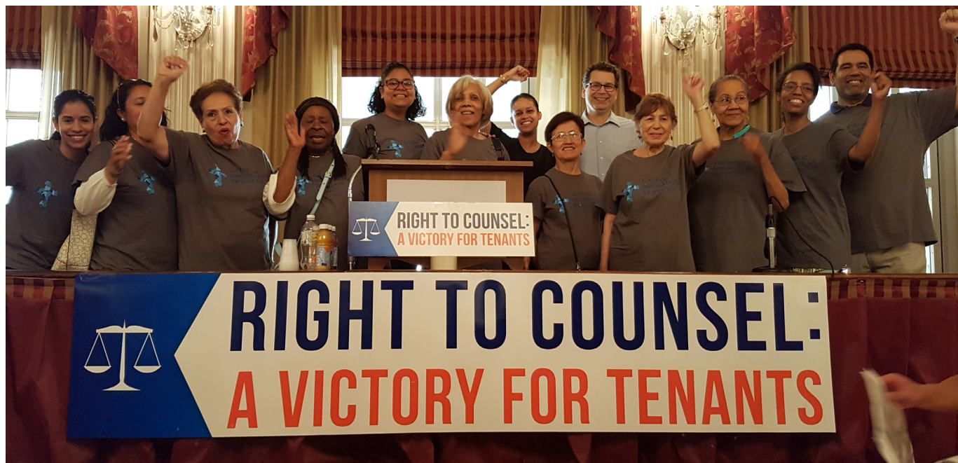
Tenant leaders from Catholic Migration Services the day NYC City Council voted to pass Intro. 214!

By all conventional metrics, Right to Counsel works. Evictions have plummeted, landlords are suing tenants less and almost all tenants who fight their cases with a Right to Counsel attorney stay in their homes. In New York City, the fight for Right to Counsel was never just about tenants having the right to an attorney—it was and is about changing the balance of power between tenants and landlords, de-normalizing evictions, and creating even more space for tenants to organize powerfully. After we won Right to Counsel in New York City, we launched the first ever Worst Evictors List, held a People’s Tribunal on Evictions, and created an organizing infrastructure to challenge the nature of evictions themselves: stopping almost all evictions in New York City for close to two years and helping launch one of the largest rent strikes in our city’s history.